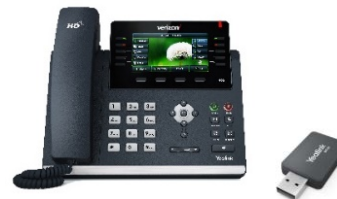
T46SW - IP Phone with Wi-Fi