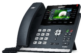
T46S - IP Phone