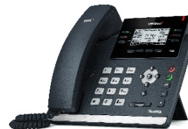
T42S - IP Phone