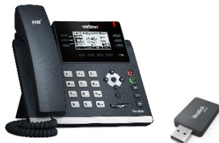
T41SW - IP Phone with Wi-Fi