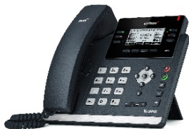
T41S - IP Phone